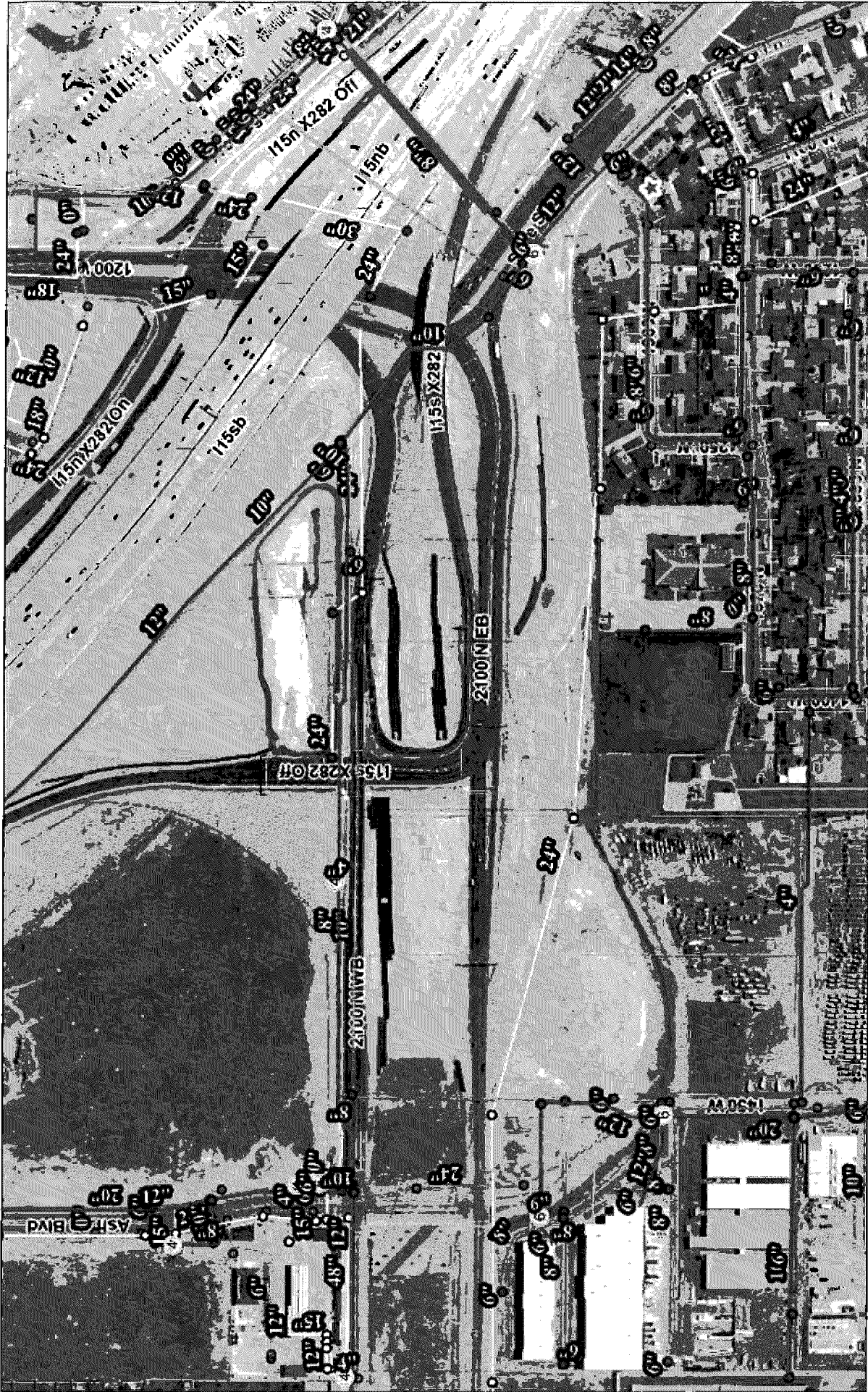
Exhibit B - Existing Lehi City Utilities within Prescriptive Easements