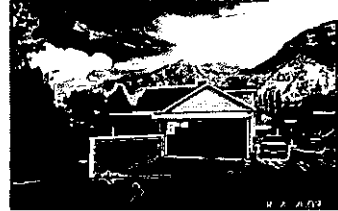
Total Photos: 1

Property Address: 976 E BRIAR AVE - PROVO Mailing Address: 86 N UNIVERSITY AV # 420 PROVO, UT 84601-5553 Acreage: 0.2 Last Document: 111973-2017