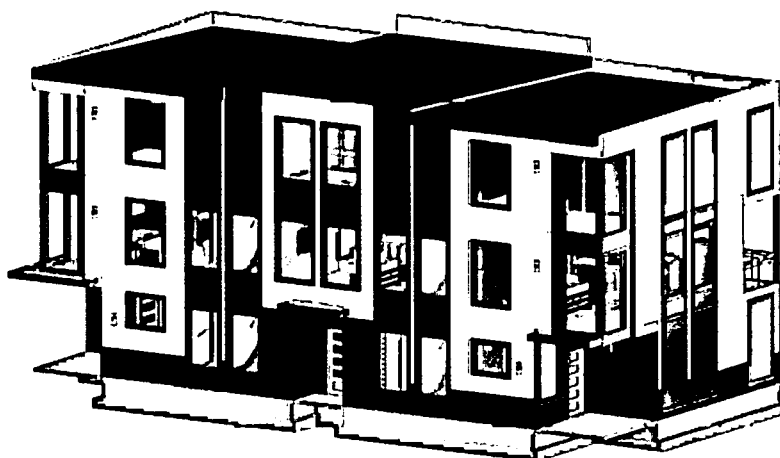
Figure 1 Rendering of Townhome Building option 1

D. The City desires to ensure realization of a product substantially the same in architectural style and configuration as was proposed in application materials (shown in the images below):