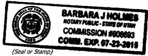
(Seal or Stamp)