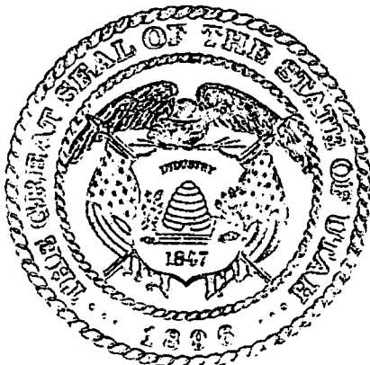
GREG BELL Lieutenant Governor

IN TESTIMONY WHEREOF, I have hereunto set my hand and affixed the Great Seal of the State of Utah at Salt Lake City, this 23 rd day of December, 2009.