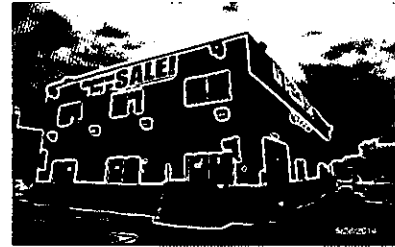
Total Photos: 4

Legal Description: LOT 1, PLAT A, AMERICAN STONE SUBDV. AREA 4.829 AC.