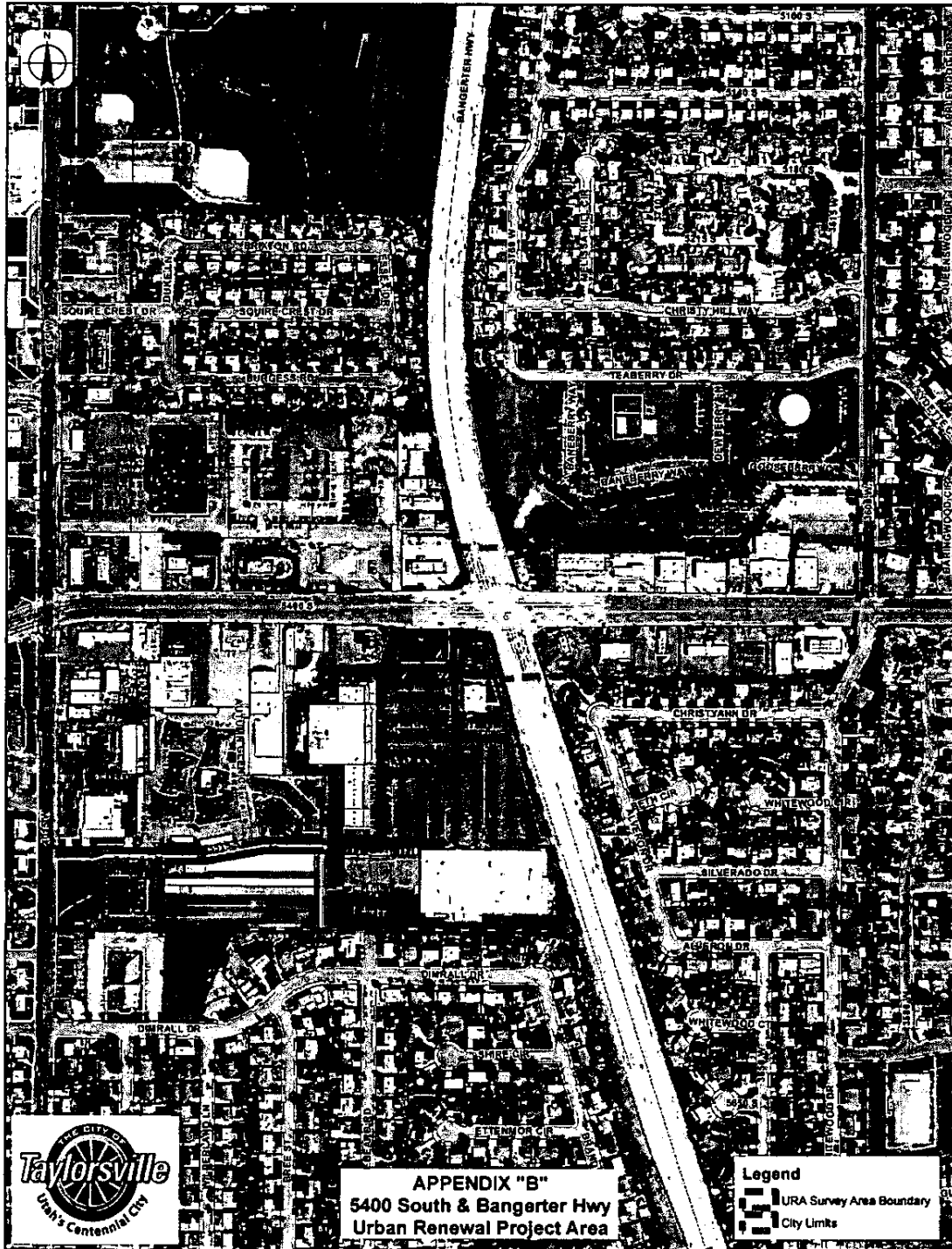
EXHIBIT "B" MAP OF 5400 SOUTH AND BANGERTER HIGHWAY URBAN RENEWAL PROJECT AREA